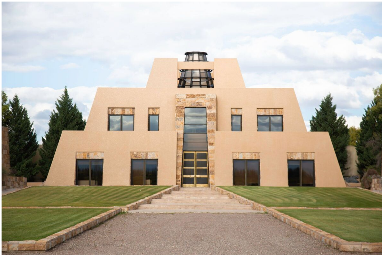
Catena Zapata in Argentina tops the list at No. 1.